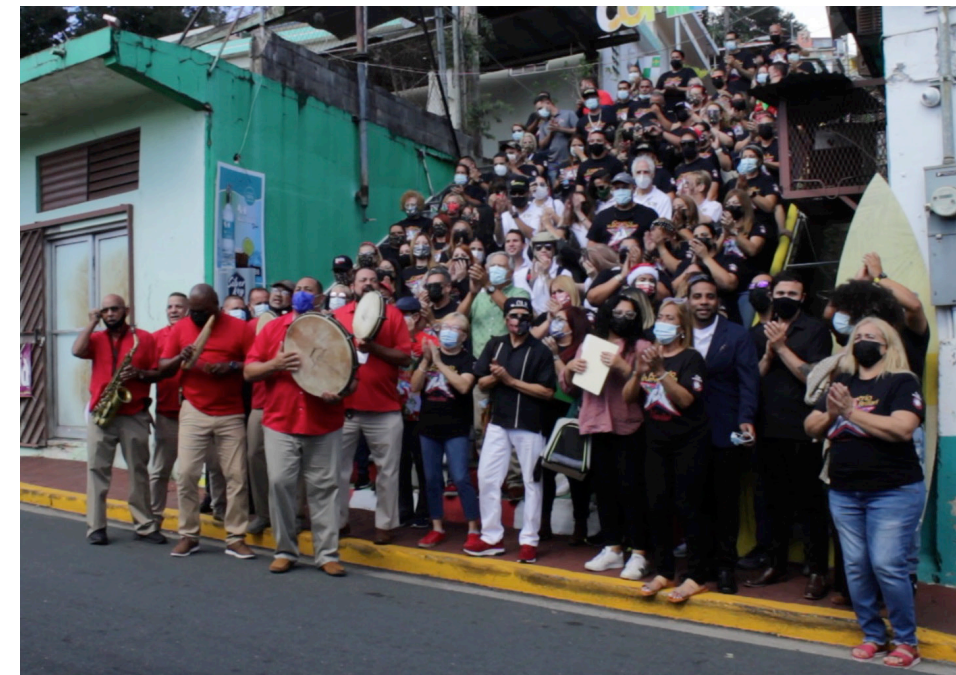
Welcome Parranda in Comerío

asado en la barrita at an incredible project in Comerío offering alternative education to students in Puerto Rico who have been pushed out of the Puerto Rican public high school system. The school is located on a 20-acre farm that provides students with creative engagement in culinary arts, visual arts, and other vocational skills. We were then taken to a housing and educational center for abandoned children with physical challenges from ages 0-5. After visiting the school, the delegation made its way to the plaza of Comerío where we were welcomed by an amazing parranda Comerieño, which was followed by the initiation of the Annual Festival Jíbaro.