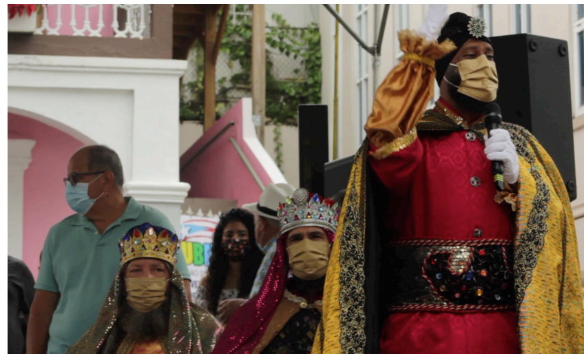
Los Tres Reyes Magos de Juana Díaz during the Santa Misa in Comerío